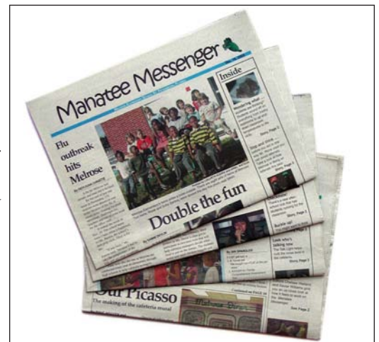
Melrose Elementary Center for Communication and Mass Media won the Time for Kids national award for elementary school newspapers for the Manatee Messenger . Time for Kids is a magazine published by Time, Inc. The issue on top won the national award in 2004.

The generation that regards newspapers as a basic utility, almost like electricity